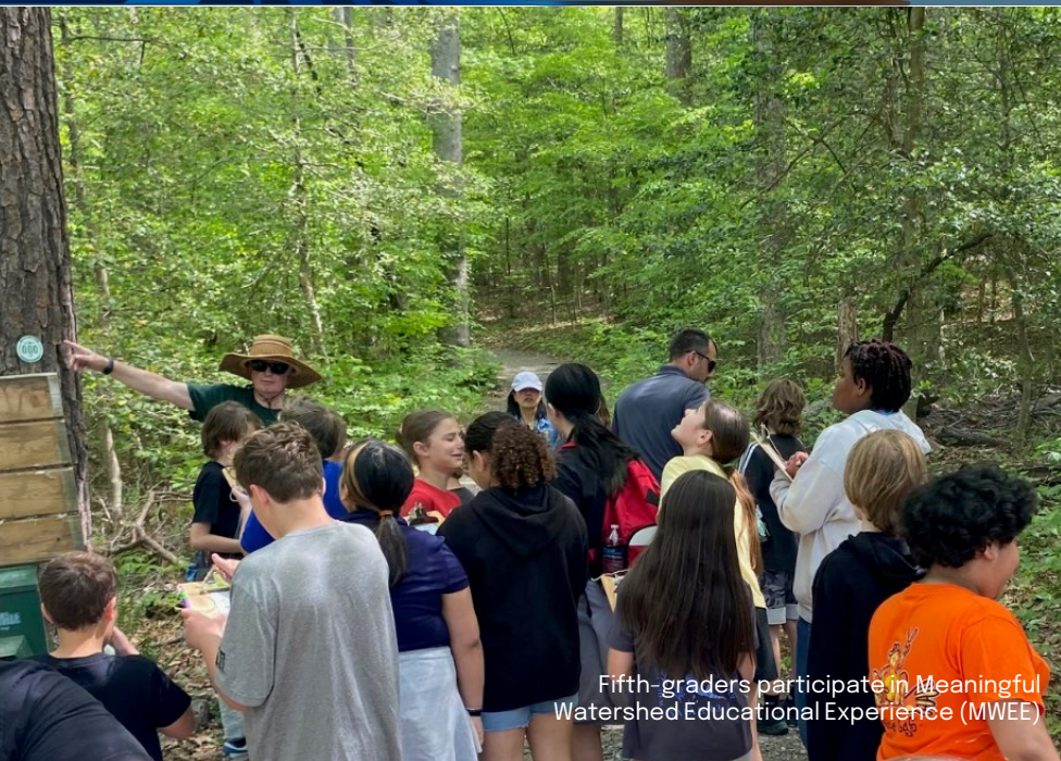
Fifth-graders participate in Meaningful Watershed Educational Experience (MWEE)